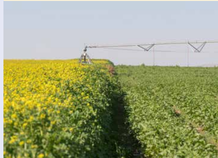
A mustard cover crop (left) included in rotation with potatoes (right) suppresses weeds, improves soil health and, when incorporated into the soil, decomposes and releases chemicals that suppress disease-causing organisms.

Good agricultural practices should focus on reducing stress to the crop and making the environment less favorable for pests.