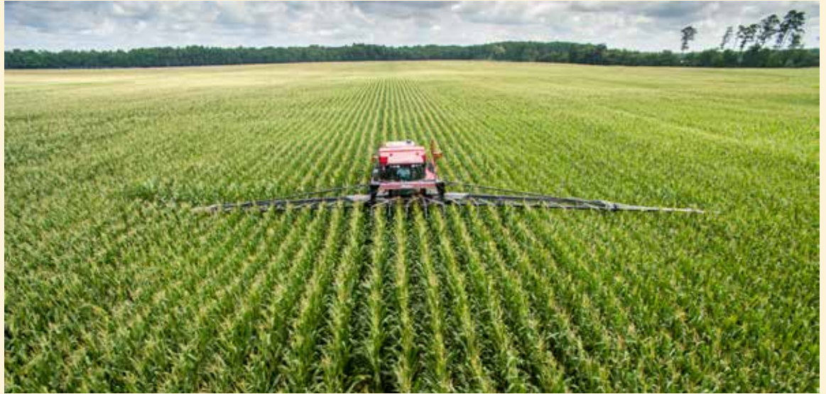
Seeding a cover crop into corn in a no-till system. This is an example of how more farmers are taking advantage of holistic, ecological principles to manage pests, nutrients and water with fewer purchased inputs.

Ecological strategies mimic and reinforce the natural relationships already built into farming systems.