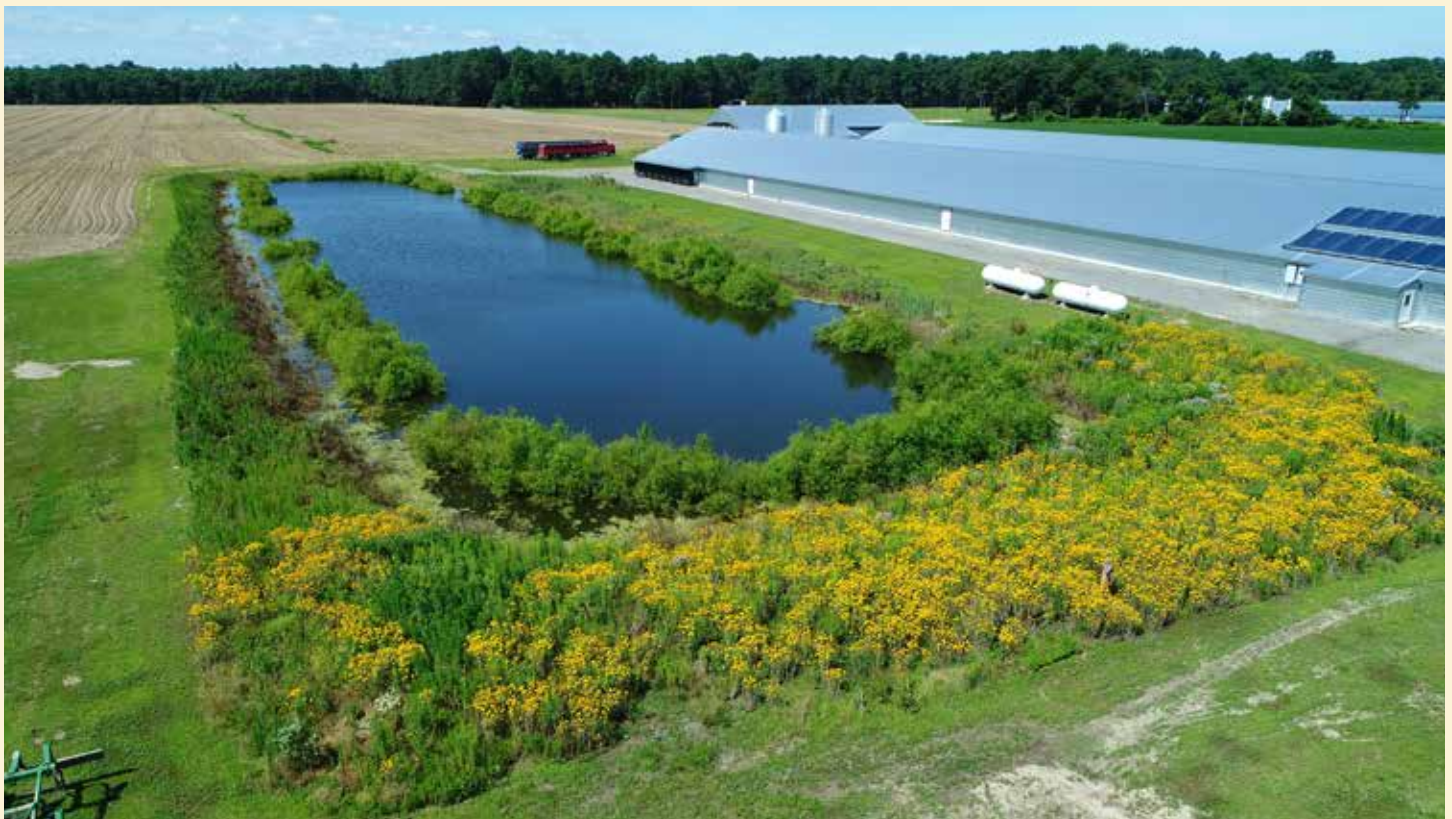
A mixed vegetation buffer near a poultry house at Hill Farms in Houston, Del., offers habitat for pollinators and natural enemies, and reduces dust coming off of the poultry house.

Visit www.sare.org/pests for more information on ecological pest management.