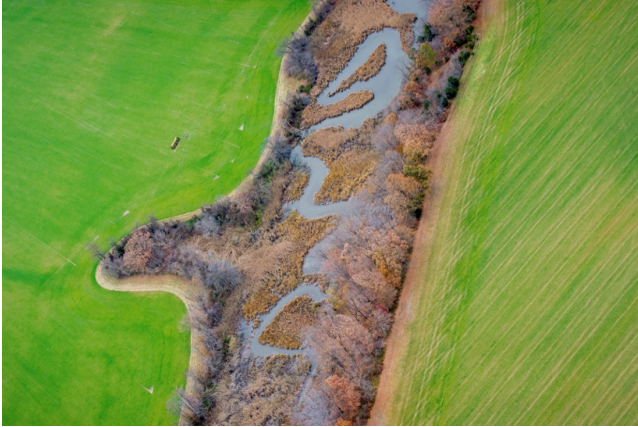
Cover crop are pictured here growing adjacent to a waterway. The cover crops help keep soil and nutrients in place, preventing them from moving off fields and into streams and lakes.