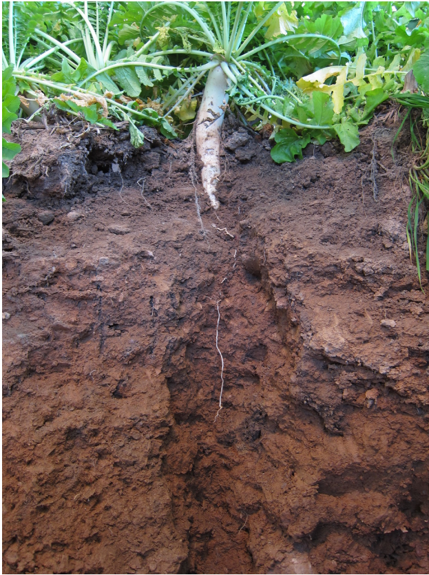
Cover crop roots can extend deep into the soil, as with the tap root that grows on down from the radish tuber pictured here. The action of roots in the soil is critical to soil health and water quality.

fields. Some cover crops, like cereal rye, can outcompete and smother weeds, reducing the need for herbicides. Most cover crops, and in particular those allowed to flower, support a more diverse community of insects that acts as natural pest control.