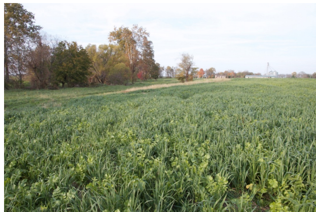
If planted in a timely fashion, cover crops can achieve substantial growth in fall as shown in this photo of rye and radish taken in early November in Indiana.

In a review of almost 60 years of cover crop and erosion research Langdale et al. (1991) found that cover crops reduced erosion from 47 to 96 percent in the United States. The other agricultural practice that can dramatically reduce erosion is no-till. 5 Cover crops and no-till combined can reduce erosion even more, often by over 74 percent. 6,7 Erosion on agricultural fields is inextricably tied to rainfall infiltration and soil water holding capacity. The effect of cover crops on infiltration and water holding capacity and the mechanisms by which they do so are discussed below.