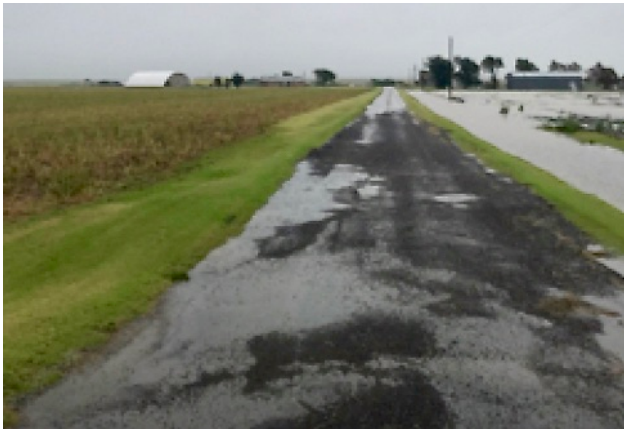
A cover crop and no-till field on the left did a much better job of soaking up a big rain than the conventionally tilled field on the right, where water ends up ponding.

Cover crops can increase soil water holding capacity through some of the same mechanisms as infiltration. Porous soil composed of stable aggregates is less dense, making more room for water. Another major reason that cover crops can improve soil water holding capacity is by building soil organic matter.