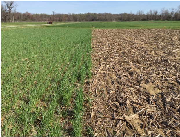
Cover crops grown from fall to spring can be effective in sequestering soil nutrients, keeping them from leaching or running off fields, unlike a field with no covers where there is nothing to hold the nutrients in place.

vegetation, limiting runoff as well as leaching within a field. Living vegetation uses nutrients from the soil, but in a traditionally managed row crop field under a corn/soy rotation, there are hardly any living roots for about seven months out of the year. Those are seven months in which excess nutrients can leave the field. Cover crops provide living roots that absorb and immobilize those nutrients, keeping them from leaching. 13