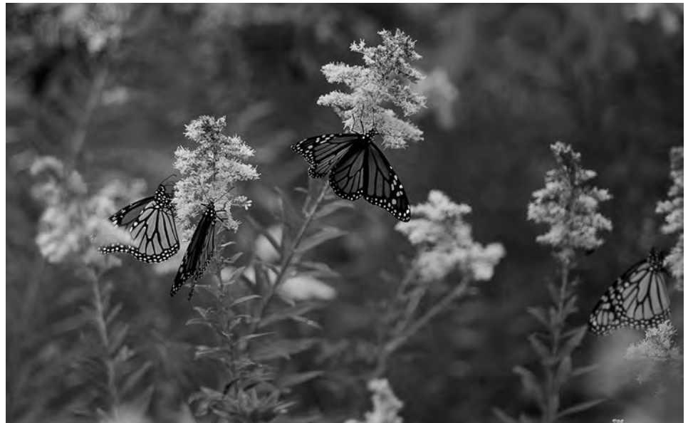
Figure 8. Monarch butterflies.

Milkweed butterflies belong to the subfamily Danainae, in the family Nymphalidae. Historically, this group had been considered a separate family, Danaidae. These butterflies get their name from feeding on milkweed plants. The caterpillars are apparently immune to the toxic juice of the milkweed and consume it voraciously. Thus, both the caterpillars and adults are distasteful to predators such as birds. The monarch butterfly is the most common and familiar milkweed butterfly and is easily recognizable by its bold orange and black color (Figure 8). (The viceroy, a brushfooted butterfly, resembles the monarch but is smaller and has a black line across the hindwing. Male monarchs have an enlarged, dark spot in the middle of each hindwing that give off a scent to attract females.