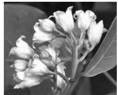
Figure 18. Dogbane.