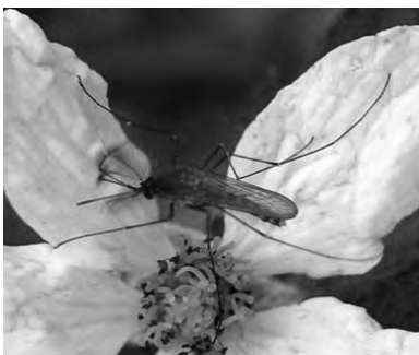
Figure 15. Mosquitoes are known pollinators of bog orchids ( Habenaria obtusata ).