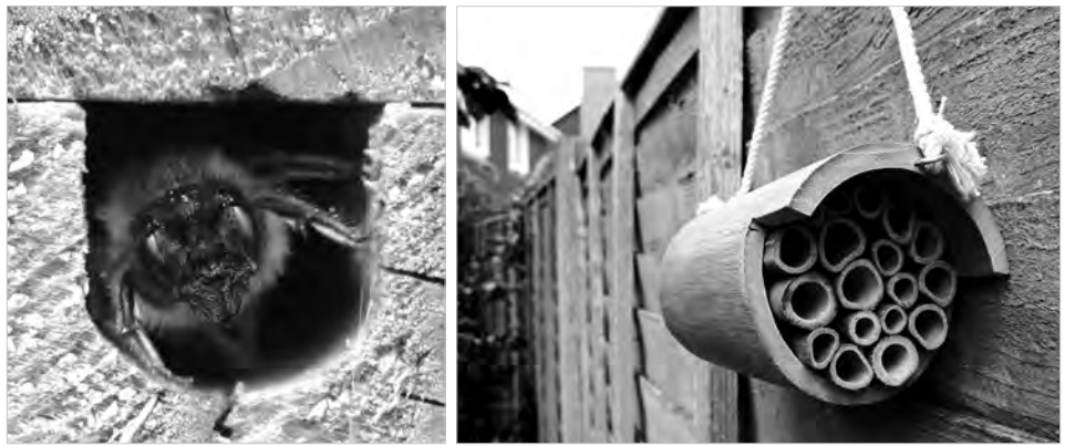
Figure 2. Structures that provide small nesting cavities can attract leafcutter and mason bees to your property.

Visit the bee hotels link in the Resources section to learn how to build a bee hotel.