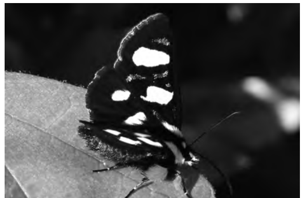
Figure 11. Eight-spotted forester moth.

Owlet, dagger or underwing moths are of the huge family Noctuidae, which numbers more than 20,000 species worldwide and more than 700 in Missouri (Figure 11). It is by far the largest family of the Lepidoptera in the state. Most noctuids are medium-sized (0.75 to 1.75 inches) and somber gray or dull brown, with a few exceptions of bright color (for example, green marvel, beautiful wood-nymph and grape epimenis). The colors and patterns of