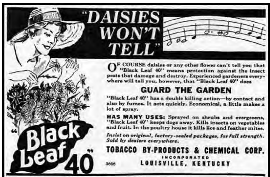
Figure 21. Most of the effectiveness of the old-time insecticide Black Leaf 40 was from nicotine, which is toxic to most insects, including bees.

A notorious misuse of a neonic took place June 17, 2013, in Wilsonville, Oregon, that brought the potential of neonics to kill or harm bees to public attention. The pesticide dinotefuran, also known by the trade name Safari, was applied to 55 blooming linden trees in a