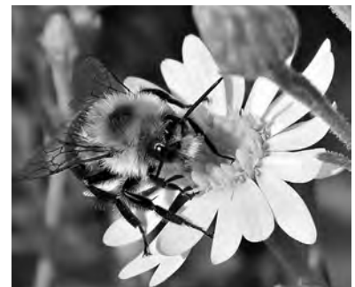
Figure 1. Bumble bee ( Bombus spp.).