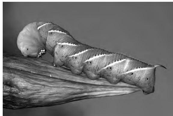
Figure 20. The tobacco hornworm is so large that it is sometimes called the Goliath worm. The distinctive horn at rear of the caterpillar (right) is the source of its common name.

Another example highlights how IPM can solve the conundrum of an insect being both a pest and a beneficial pollinator. Large caterpillars known as hornworms feed on tomato plants and can destroy leaves and fruit (Figure 20). There are two species, the tobacco and tomato hornworm ( Manduca sexta and M. quinquemaculata , respectively), whose adult phases are the desirable and fascinating