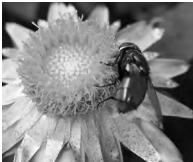
Figure 13. Blow fly, or green bottle fly.

Studies have revealed that the occurrence of OE is higher in monarchs that do not migrate, such as those found in southern Florida. The year-round presence of tropical milkweed ( Asclepias curassavica ) — which is attractive, easy to grow, and widely available through commercial nurseries — also may be facilitating the spread of this parasite in some U.S. regions. As an IPM strategy to reduce this spread, it is recommended that tropical milkweed be cut back in the fall when native milkweeds age, gradually replacing tropical milkweed with appropriate native species in landscaped areas.