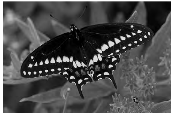
Figure 3. Black swallowtail.

Small butterflies that are commonly blue and gray are called blues and hairstreaks (family Lycaenidae) (Figure 6). Some members of this butterfly group appear as small versions of swallowtails. However, these small butterflies have only thin, hairlike extensions projecting from the hindwings, not the wider, more developed wing extensions of swallowtails. At rest, blues and hairstreaks characteristically hold their wings folded over their backs. In this posture, patches of orange that decorate many species can be observed. Birds often strike color patches or tails, mistaking them