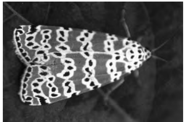
Figure 10. Bella moth.

Tiger moths (family Arctiidae) are also referred to as tussock, ctenucha or lichen moths (Figure 10). The common name of woolly bears may also be associated with the caterpillars of several species. The intriguing long, thick hair and color pattern of these caterpillars have led to interesting folklore on the severity of the upcoming winter. These moth species number about 10,000, with 60 having been recorded in Missouri. The color, pattern and size of these moths vary greatly, but their wings are frequently striped or spotted, suggesting the name tiger moth. Many feed on poisonous plants and produce poisonous compounds. These species have evolved patterns of bright “warning colors,” such as that of the scarlet-winged lichen moth ( Hypoprepia miniata ). Another novel characteristic of some species is the high-frequency sound they produce in flight, which supposedly warns bats that the moth is distasteful or poisonous. The artistic calico moth is associated with flowers, especially goldenrod. Most species of this family overwinter as fully developed larvae or as pupae.