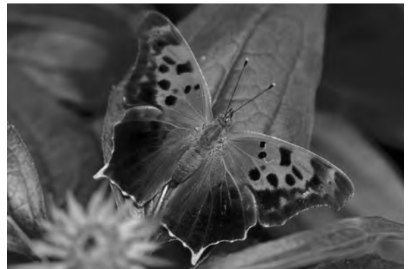
Figure 4. Question mark.