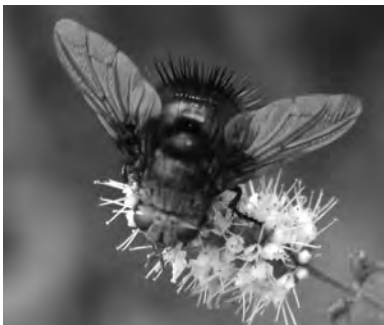
Figure 14. Tachinid fly.