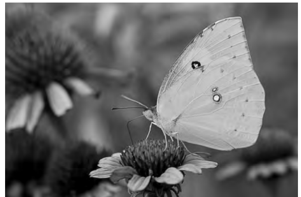
Figure 5. Dogface sulphur.