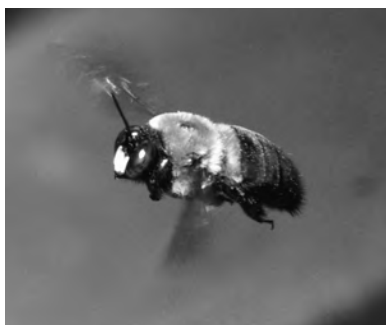
Figure 19. Carpenter bee.