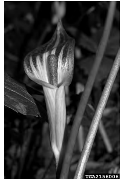
Figure 17. Jack-in-the-pulpit flowers have a funguslike smell that attracts many tiny insects, particularly fungus gnats.