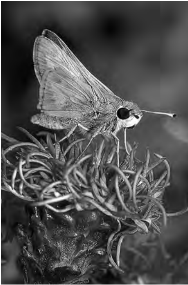
Figure 7. Skipper.

for butterfly heads and allowing the butterflies to escape. Some caterpillars of this family produce a sugary substance called honeydew that is “milked” from the caterpillars by ants. In return for this honeydew, the ants protect the caterpillars from predators. The adult butterflies of this family are seen around flowers growing along roadsides, in fields, and in other open areas.