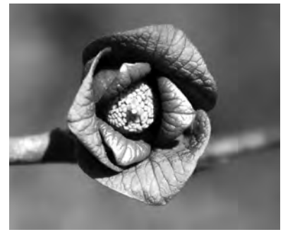
Figure 16. The meat-colored petals and fetid aroma of pawpaw ( Asimina triloba ) attract flies and beetles.

Some people think pesticides are only used for controlling insects. By definition, a pesticide is any product that kills or repels pests. Pests can include weedy plants or plant diseases, animals such as moles, and even household mildews, molds and bacteria. Therefore, products designed for use as disinfectants, toilet bowl cleaners, insect foggers and even pet flea collars are considered to be pesticides. If you are unsure whether a product qualifies as a pesticide, check the package label for pesticide registration numbers issued by the U.S. Environmental Protection Agency (EPA). Pesticide labels carry two EPA registration numbers: the first